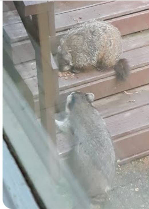
Groundhog dragged the food bowl down the steps, and raccoon is like WTF???