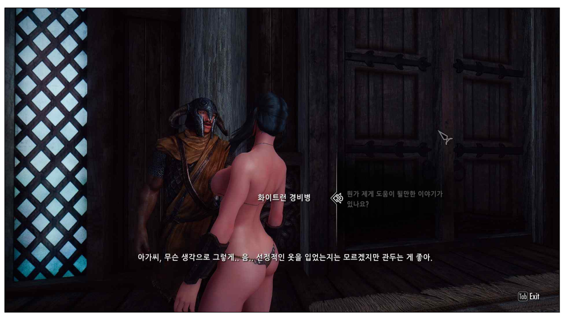
Player: Is there any advice that you can give? Whiterun Guard: What are you thinking? I don`t know why you are wearing such a suggestive clothes but you`d better stop wearing that.

The guard's duty is to protect citizens and they are somewhat ready for the better s service so they are rather responsible and moral so that they become worried about your safety whenever you wear suggestive clothes, and at the same time they scold you for carelessness. Be warned when you enter the city lack of security. They won't be kind to you at least.