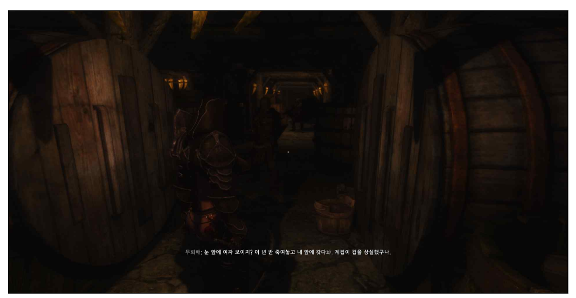
You are surrounded by outlaws who want to make you their sex slave. outlaw: You see this bitch? Beat her to the ground and bring her to me. I gotta taste her little pussy.

For example when you enter the certain inn far from the town in careless pretty outfit(Let`s say skimpy), the event is going to happen.